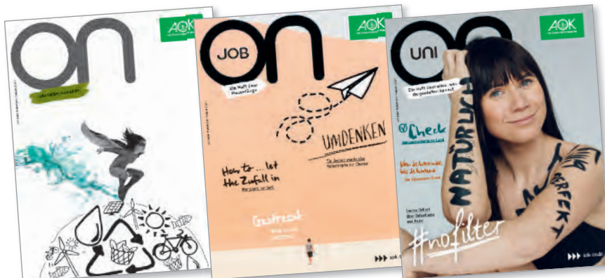
on – for school

on, on JOB and on UNI go to the heart of lifestyle, health, fitness and valuable information. Everything that's in: from one person to another. There's a wide range of topics: love, sport, your professional and personal future and also nutrition and pleasure. Three different editions deal with what is important for young people still at school, trainees and university students: